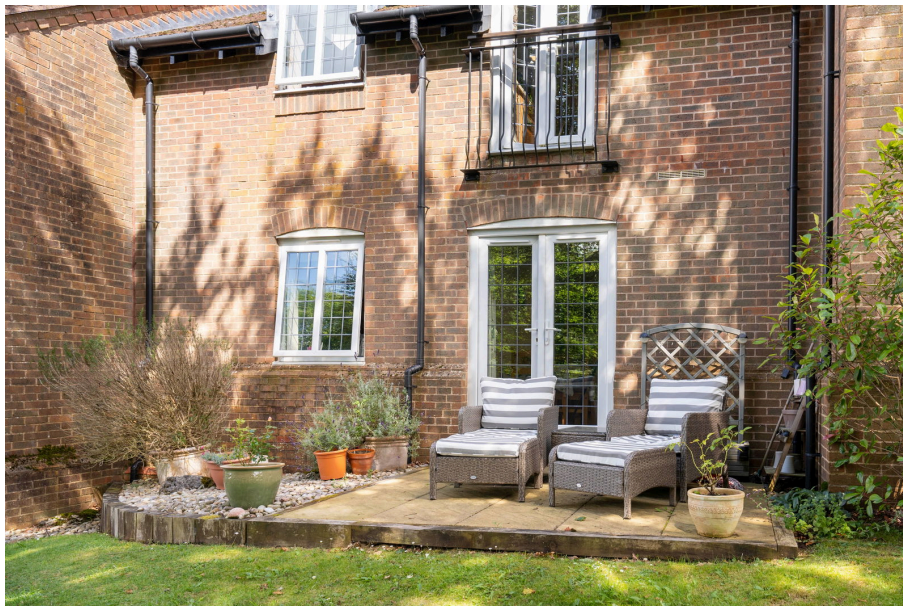
Forhill Court, Lea End Lane, Alvechurch